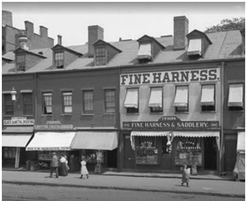
A 1910 photo of Hudson Street between Barrow and Grove Streets.

A good-government group is calling on city watchdogs to investigate Mayor de Blasio and political nonprofits he has set up like Campaign for One New York which alone had taken in $3.87 million as of last September—that rake in millions, push his political projects, and pay his friends, unfettered by campaign finance restrictions. Common Cause New York says de Blasio's "unprecedented use" of nonprofits to raise money "has spawned a shadow government. Recently he created the United for Affordable NYC, in part with money from the former group, to push his controversial affordable housing plan. Both organizations run on money from big donors including developers, unions, taxi medallion kingpins, and contractors. Donations to the Campaign for New York have included $350,000 from the American Federation of Teachers, which was negotiating a contract with the city, and $100,000 from the developer Two Trees Management Company.