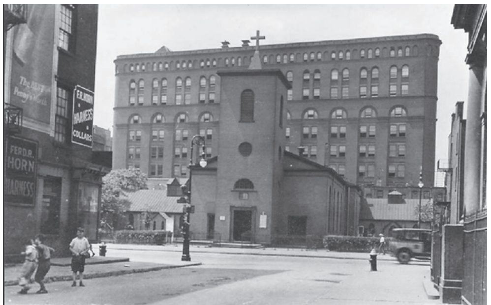
A view of the Grove Street playstreet from 1927 with a view of St. Luke’s Chapel.

Saturday 10.08, Tavern Supper, Steven Gedra, The Black Sheep, Buffalo, NY. Contact James Beard Foundation < reservations@jamesbeard.org > for information.