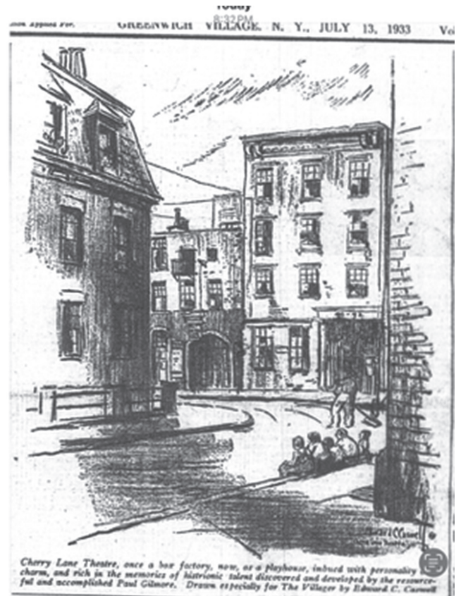
from The Villager, July 13, 1933